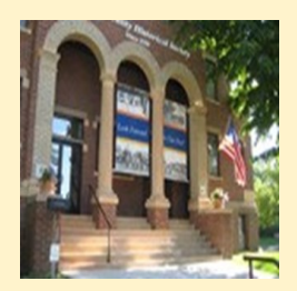
The Waseca County Historical Society 2019 Financials Posted Separately