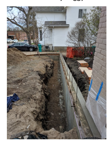
New ramp construction, Bailey/Lewer House