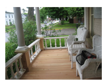
Porch Restoration, Bailey/Lewer House